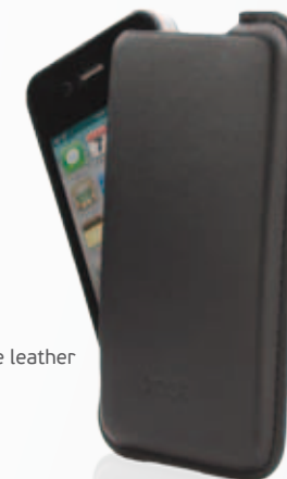
Art. No.: XQ4034