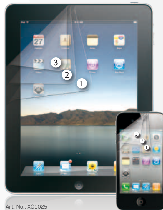
Art. No.: XQ1025