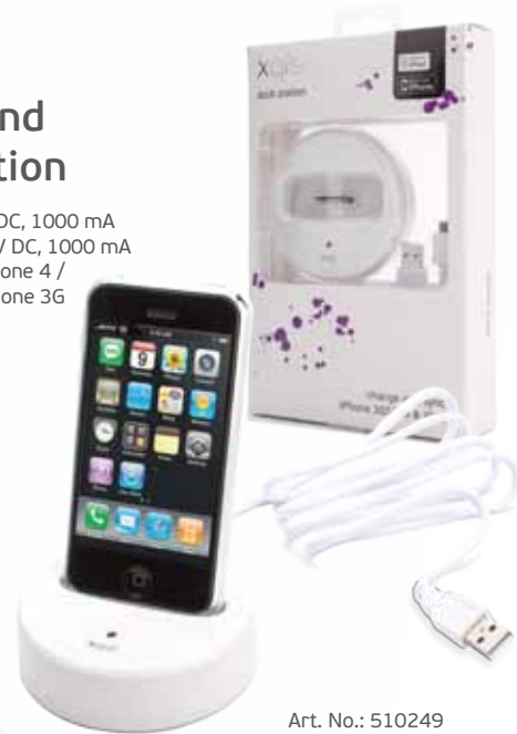
Art. No.: 510249